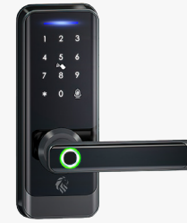
LHL-ER5-B-RATHDOWNE FULL BLACK