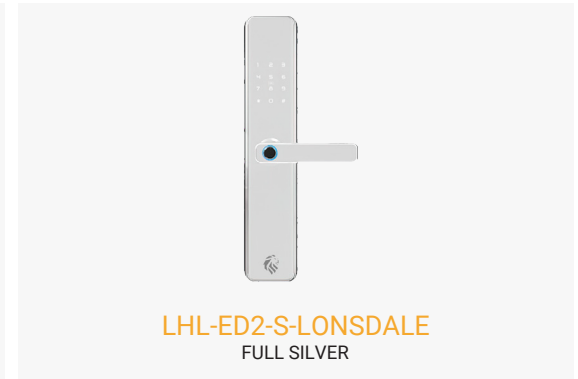
LHL-ED2-S-LONSDALE FULL SILVER