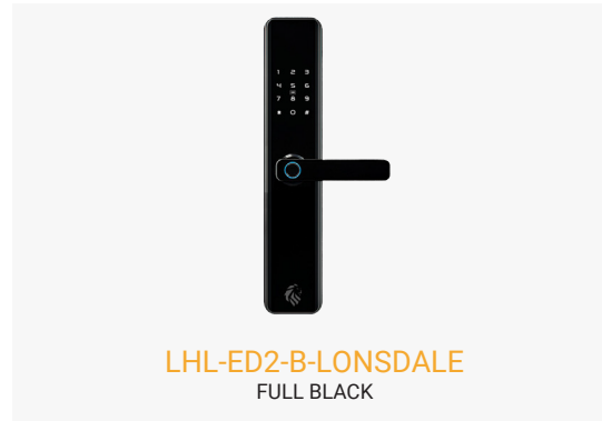
LHL-ED2-B-LONSDALE FULL BLACK